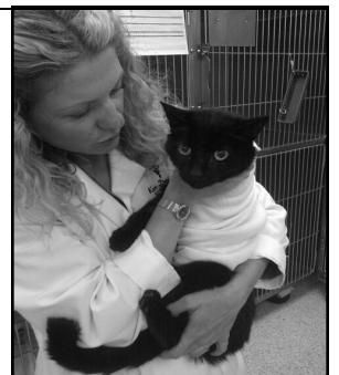
Coyote in Recovery

step outside, Coyote would sit by the open door and watch. He didn't seem anxious to return to the outdoors, although he did have fun once he learned to operate the dog door. Now, he occasionally runs to the front door, only to sit outside on the front porch like a sentinel. He is an incredibly loving cat – and, yes, he eventually learned to live in harmony with the other critters of the house. Well, except for the comical hallway stand-offs between Sundance, a golden retriever who willingly defers to cats and will not try to go around them, and Coyote, who knows this and seems to enjoy it. Coyote crates himself when requested, falls limp into any arms that offer to carry him, adores rides in the car, and loves